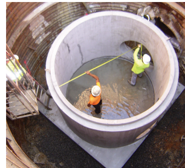
Tunneling crew installing a 10-foot-diameter manhole on Morningside Drive near the intersection at Commonwealth Avenue.

When activated, the new sewer line will provide needed capacity, reduce the risk of sewer overflows, protect the water quality in Briar Creek and meet demands for growth.