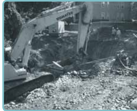
Eastover Park creek crossing during project construction