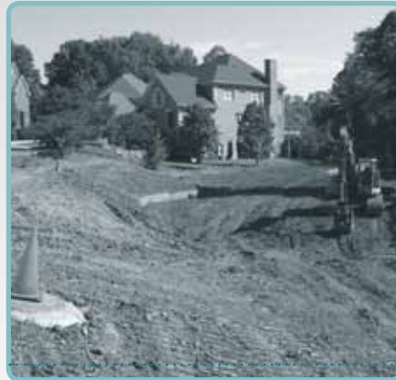
Lila Wood Circle just after pipe laid and manholes installed

Freeze cooking grease and oils in a coffee can, or mix liquid vegetable fats with kitty litter or coffee grounds in a lidded container. Deposit it in the trash, or at a full-service recycling center.