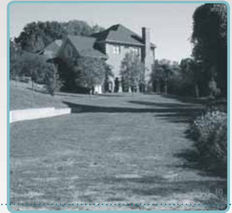
Lila Wood Circle now after all permanent restoration