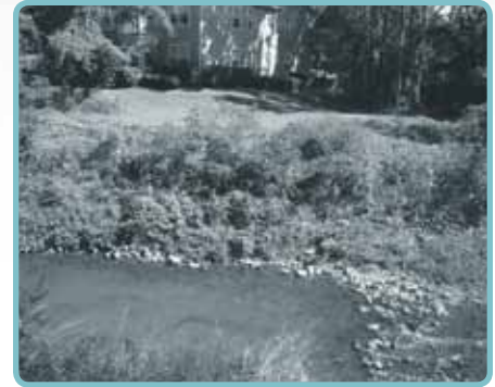
Eastover Park now after permanent restoration

For the latest information about the Briar Creek Project, visit the web site at www.cmutilities.com and click on "Construction Projects." You can also dial 311 for more information.