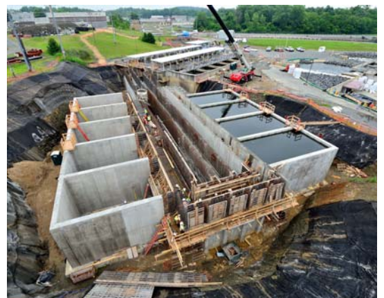
Filter expansion at McAlpine WWTP

A new generator building at Irwin Creek Wastewater Treatment Plant provides more reliable backup power for the entire plant, as part of a $20 million first phase of renovations to this nearly 90-year-old facility. Construction continues on major sewer line improvements along Briar Creek and McAlpine Creek, and a $25.5 million filter expansion project under way at McAlpine Creek Wastewater Treatment Plant represents one of the City's first design-build contracts. Design-build affords an owner more opportunities to review the design as it progresses, which gives more opportunity for value engineering and flexibility.