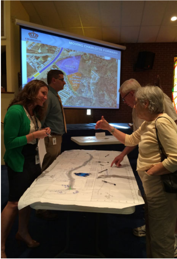
Speaking to the community at a public meeting at Newell Presbyterian Church

A community meeting was held for the Rocky River Road West Streetscape Project on August 26, 2014, at Newell Presbyterian Church. Approximately 50 citizens attended. The Rocky River Road West project will provide turn lanes for new developments taking place along Rocky River Road West, as well as provide sidewalk and bike lanes from North Tryon to Batavia Lane.