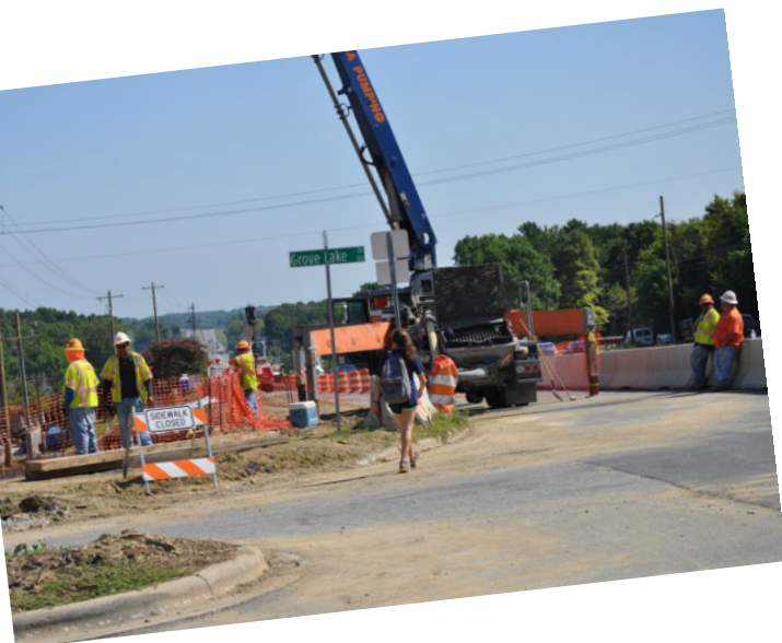
Pedestrian safety signs, construction crews and detour sidewalk on North Tryon Street and Grove Lake Drive

BLE construction is ramping up, and with that, pedestrian safety around construction zones is not only a hot topic but a vital issue.