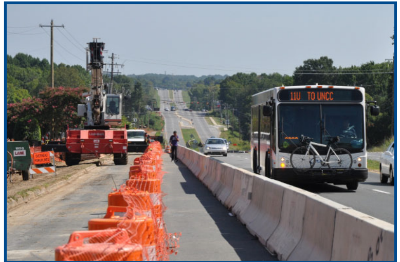
Temporary detour sidewalk on North Tryon Street

Motorists, cyclists and pedestrians will experience a traffic corridor with frequent pattern changes and multiple work locations throughout the end of the summer, during the fall season and well into 2015. Construction crews will be building a wider new roadway for North Tryon Street. The travel lanes will extend beyond the edge of the existing pavement. In some instances traffic lanes may be narrowed and traffic may be shifted to create room for the crews to work. Along with the widening of the road, the BLE project involves the addition of sidewalks on both sides of North Tryon. During this construction period, there will be times when pedestrians will have to follow sidewalk detours to safely reach their destinations. The roadway work will be in full swing by later this summer and the beginning of fall. Everyone who uses North Tryon will need to be far more alert to the warning signs, detours and directions from construction flaggers.