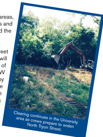
Clearing continues in the University area as crews prepare to widen North Tryon Street.

The contractor is clearing trees and low shrubs on North Tryon Street between JW Clay Boulevard and Barton Creek Drive. The contractor will build a long series of retaining walls along the outside shoulder of southbound North Tryon Street between Barton Creek Drive and JW Clay Boulevard. Crews will also clear through the woods towards Toby Creek to create a construction entrance onto the UNC Charlotte Campus and start building the first sections of storm drainage on the UNC Charlotte campus. CATS construction managers are working closely with university staff to maintain access for students, faculty, staff and visitors.