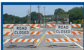
Please allow extra travel time and follow the detour signage throughout the construction phase.

Eastway Drive is now closed at the bridge over the Norfolk Southern (NS) and North Carolina Railroad tracks. The barricades are placed just south of Curtiswood Drive and just north of Howie Circle. No vehicles or pedestrians can travel over the bridge. The first steps are milling the pavement, removing more pavement with high-pressure water spray, then applying a new pavement overlay in the section of the bridge that will remain in place. This work requires warm and dry weather for certain steps of the paving process. Soon crews will be ready to excavate the soil from under the north end of the bridge to begin the construction of the additional span to extend the bridge farther north. This extra length on the bridge is required so there will be room under the bridge for the