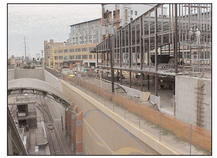
Mockingbird Station, DART, Dallas, TX