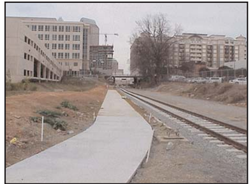
Sidewalk next to South Corridor Trolley/LRT line, Charlotte, NC