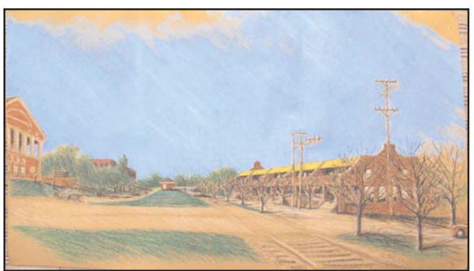
Rendering - Downtown Plan Davidson, NC