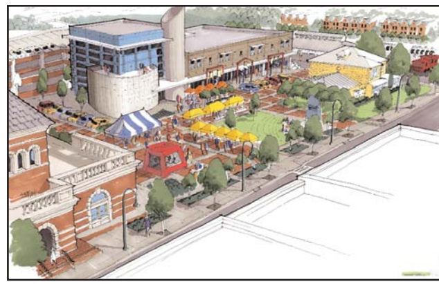
Rendering - Mixed-Use Development Huntersville, NC