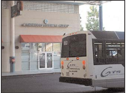
Transportation Center, Charlotte, NC