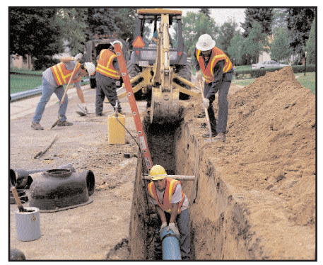
Utility crew, Charlotte, NC