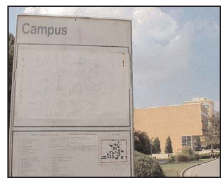
University of North Carolina at Charlotte

Also, consider joint use opportunities with schools when a library or park is proposed near a transit station.