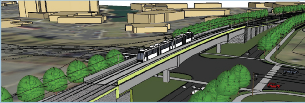
Rendering of W.T. Harris Boulevard Bridge