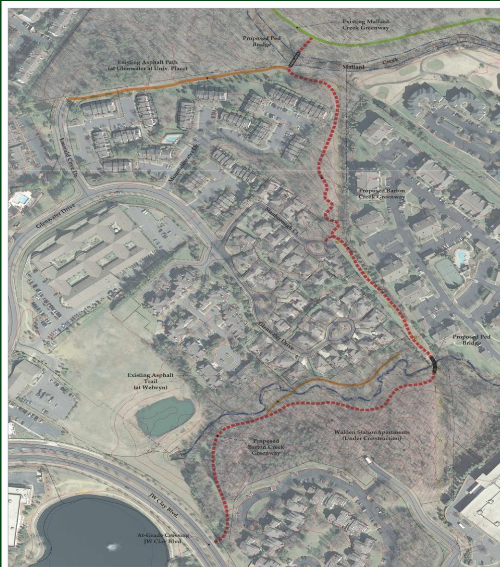
Barton Creek Greenway - Preliminary Alignment Mecklenburg County Park & Recreation