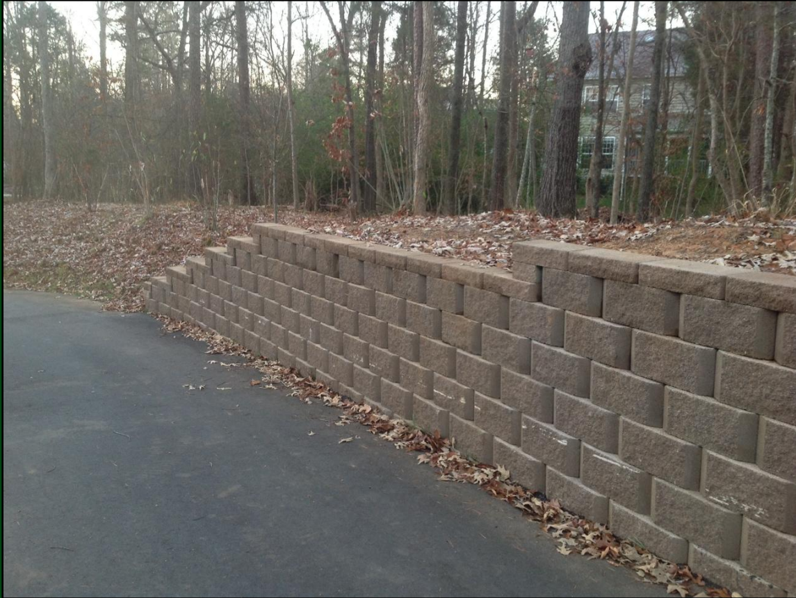
Four Mile Creek Greenway in Matthews