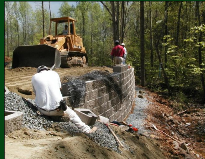
Mallard Creek Greenway