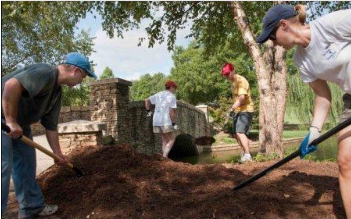
Volunteers work on landscaping projects in Freedom Park.

More than 17,000 volunteers helped Park and Recreation during FY-11, logging close to 100,000 hours of service. The value of their service is over $2 million dollars.