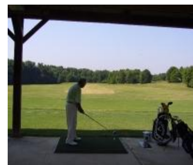
Cadillac Golf Ranch