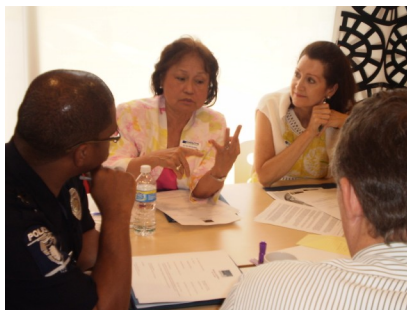
Past and present executive board members collaborate to foster success.

and expertise of Cabinet Members to help further our mission. The Mayor closed by asking the Cabinet to also consider initiatives that address issues of public safety as they relate to Charlotte's international community.