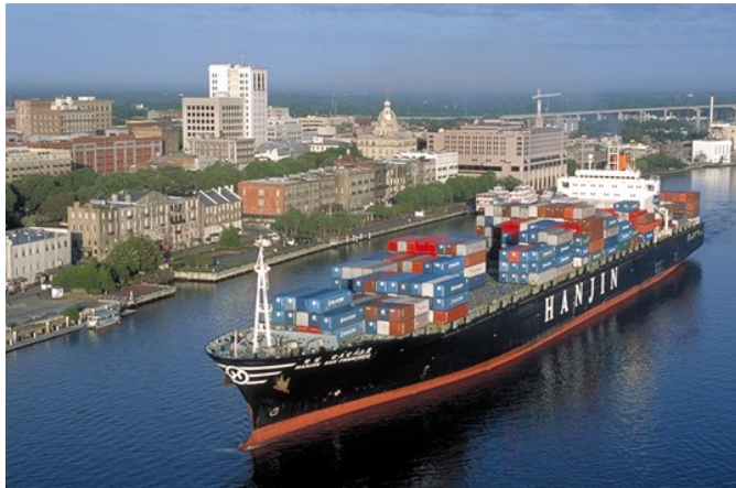
Savannah looks to Charlotte for advice on promoting itself as an international city