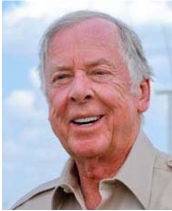
T. Boone Pickens pictured above

T. Boone Pickens, American financier who chairs the hedge fund BP Capital Management, is coming to speak here in Charlotte on Wednesday, Oct. 21. The town hall styled event will focus on the Pickens Plan which offers one solution for ending the United States' dependence on foreign oil. The premise of the