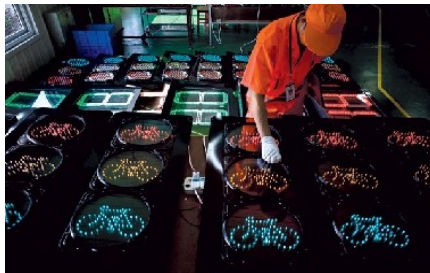
Technician works on solar-paneled traffic lights