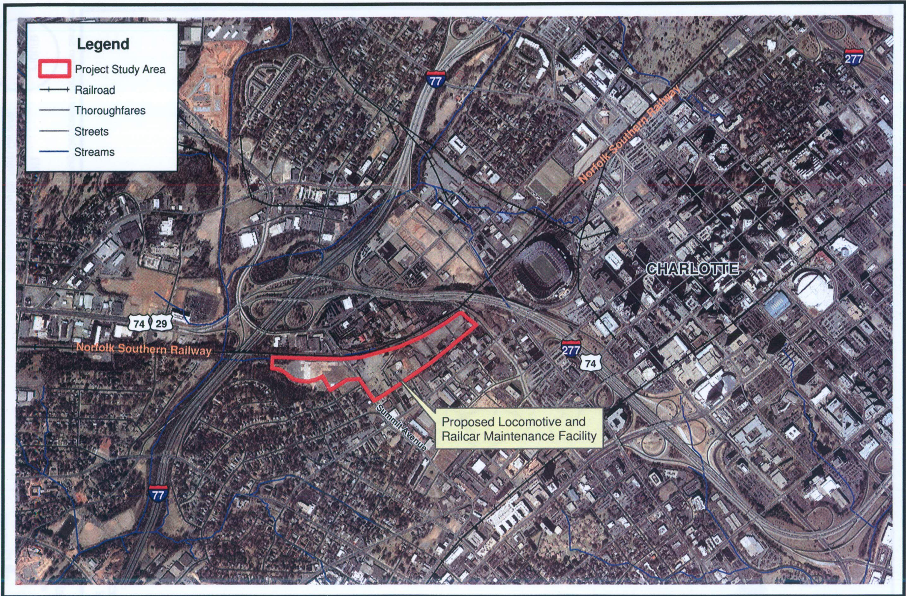
Charlotte Railroad Improvement & Safety Program (CRISP) Locomotive and Railcar Maintenance Facility Project

Data courtesy of Charlotte-Mecklenburg Geospatial Information Services