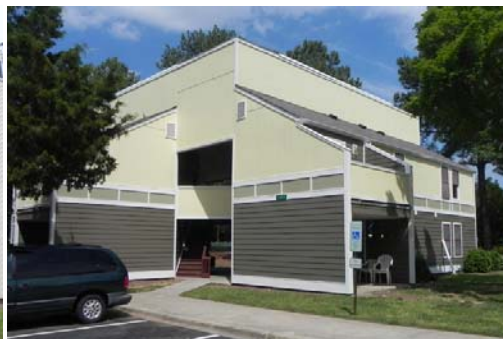
(left to right) Sunridge building before and Sunridge building after renovation.

Renovations to the Sunridge Apartments began on April 11, 2011. The work includes removing the existing vinyl siding of twelve buildings at the site and replacing it with James Hardie siding. The renovation is being funded through CHA's Moving to Work monies, locally known as Moving Forward. Completion of the approximately $245,000 in upgrades is scheduled to be completed by the end of 2011.