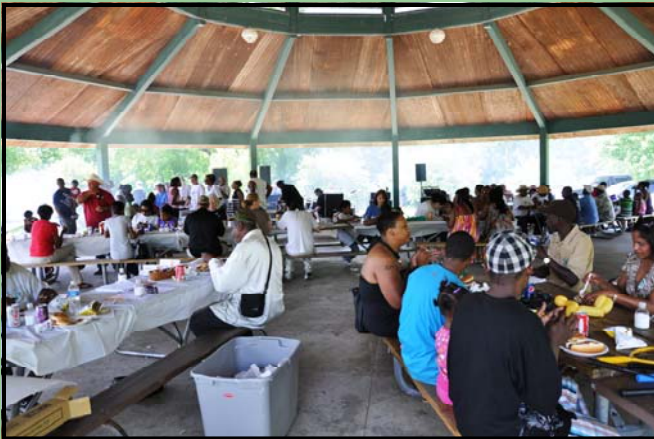
Great food and fellowship!