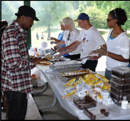
DTC Team Members serve cookout attendees.

On Saturday, May 21, 2011, DTC clients, team members and family members enjoyed an afternoon cookout at Hornet's Nest Park. There was great food, live music, clowns, face-painting, games and fellowship!