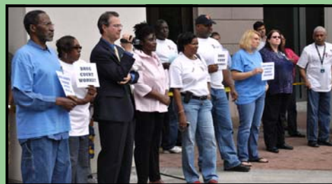
Above: Rally attendees show support.

Below: Hand-made posters serve as the backdrop for rally speakers.