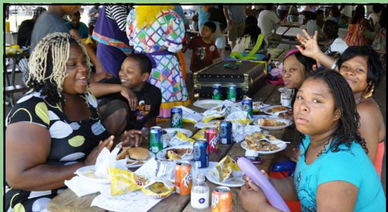
Family members enjoying the day!