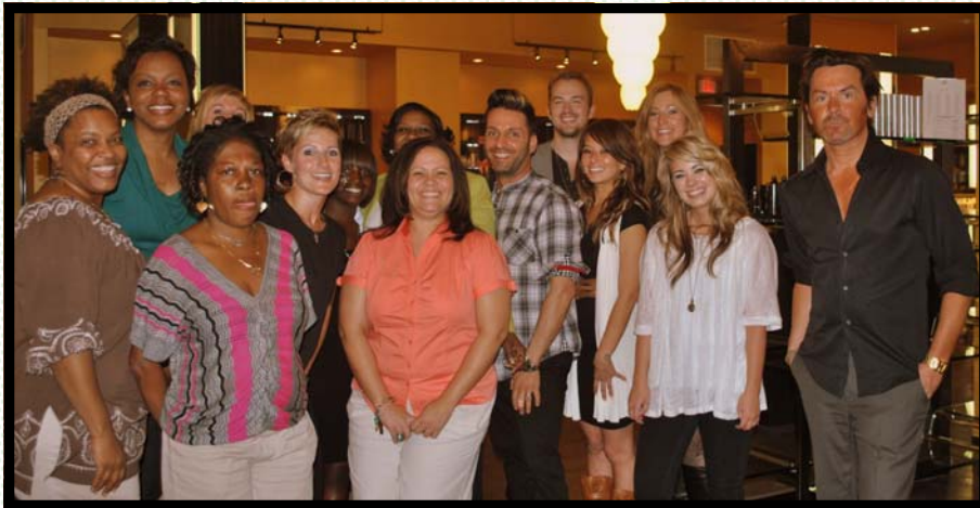
Planet 21 Staff Members, Drug Treatment Court Clients and Staff Members.