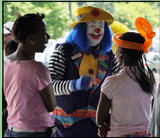
Clowns entertain the guests.