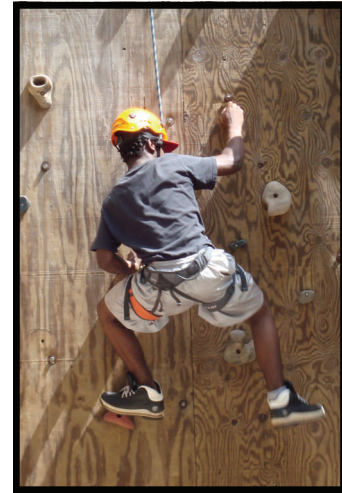
A YTC participant makes his way up the climbing rock wall.

On Friday, August 20, 2010, the Youth Treatment Court participants and several team members traveled to Rutherford County, NC to participate in a day-long outing on the Ropes Course at Camp Schiele. The day was spent in activities designed to help build self-confidence and encourage team building. Our partnership with Boy Scouts of America and Project Challenge made this event possible and we would like to extend a hearty thanks to both organizations.