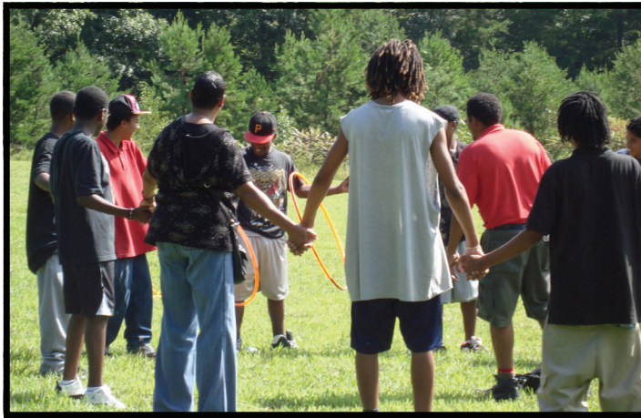
Above and Right: YTC participants complete exercises focusing on "teamwork."