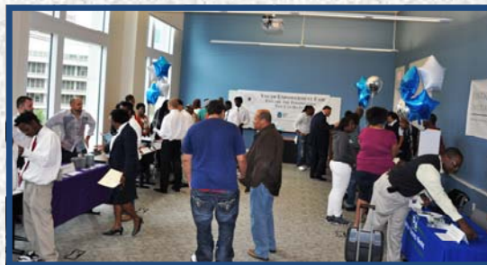
The career fair was a huge success!

While the youth attended the career fair, parents were given the opportunity to attend a rap session, where they shared helpful information with one another that will assist them as they move forward in raising their teens. This portion of the event was hosted by Innergy and ParentVoice. The event was a huge success and it is the hope of YTC that positive seeds were planted that the youth will utilize in their future endeavors.