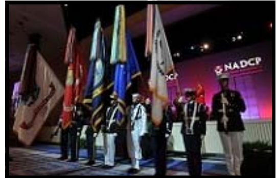
A presentation of the colors is given by the Joint Armed Forces Color Guard at the Opening Ceremony.

In the twenty-two year history of Drug Courts, there has never been a more historic and impactful four-day stretch than what occurred in late July during The National Association of Drug Court Professionals's 17th Annual Drug Court Training Conference. The world's largest conference on addiction and the criminal justice system was also the largest in NADCP's history, with over 3,600 state and federal justice leaders, celebrities, judges, prosecutors, defense attorneys, clinicians, police, probation officers, veterans, business owners, Drug Court graduates and family members from around the world in attendance. Ten team members from Mecklenburg County's Drug Treatment Courts were among those that attended.