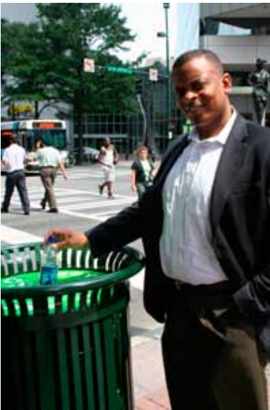
Above: Mayor Anthony Foxx participates in the On-Street Recycling initiative.

In his remarks at the projects' launch event, Charlotte Mayor Anthony Foxx said, "Like other energy and conservation ideas developed under the block grant, this initiative is based on input given at community meetings, discussions with business and community partners, and suggestions made by residents. Collaborating with Center City Partners and other business organizations enabled us to develop this project, which engages citizens, visitors and Uptown workers in Charlotte's efforts to become a model city for green initiatives and energy-saving opportunities."