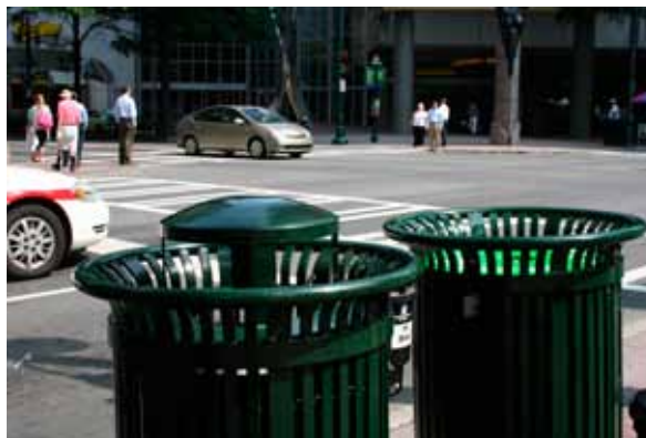
Right: New on-street recycling bins can be seen at Trade and Tryon Streets, as well as throughout uptown.