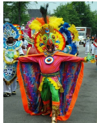
Performer at the Caribbean Festival

With Charlotte's West Indian population perpetually growing, we continue enjoying the