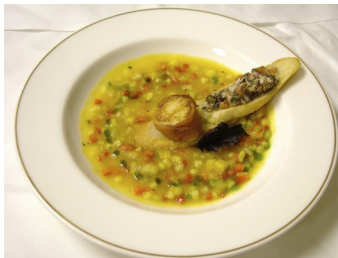
Add a touch of this, a dab of that, and voila! Soup!