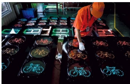
Technician works on solar-paneled traffic lights