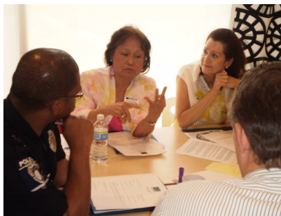
Past and present executive board members collaborate to foster success.

and expertise of Cabinet Members to help further our mission. The Mayor closed by asking the Cabinet to also consider initiatives that address issues of public safety as they relate to Charlotte's international community.