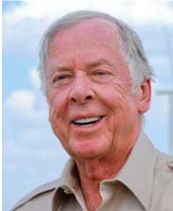
T. Boone Pickens pictured above

T. Boone Pickens, American financier who chairs the hedge fund BP Capital Management, is coming to speak here in Charlotte on Wednesday, Oct. 21. The town hall styled event will focus on the Pickens Plan which offers one solution for ending the United States' dependence on foreign oil. The premise of the