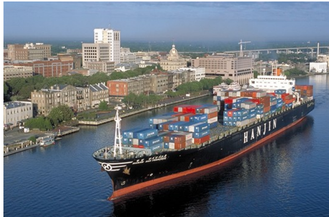
Savannah looks to Charlotte for advice on promoting itself as an international city