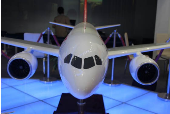
Model of the C919

"Goodrich is committed to extending its footprint in China, the world's fastest growing market