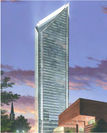
Duke Energy Center 550 South Tryon Street