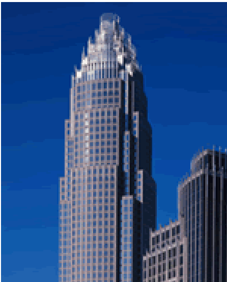
Bank of America Corporate Center 100 North Tryon Street