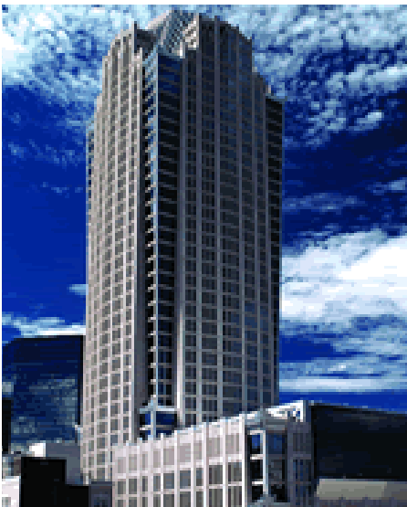
Hearst Tower 214 North Tryon Street