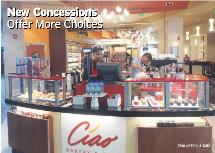
Ciao Bakery & Café

More concession choices await passengers at Charlotte Douglas this summer. HMSHost, CLT's food and beverage concessionaire, has introduced fine wine and Italian coffee into its lineup of delectable drinks. Beadevin, a wine and tapas restaurant, is now open in the Atrium. The eatery offers over 30 great wines,