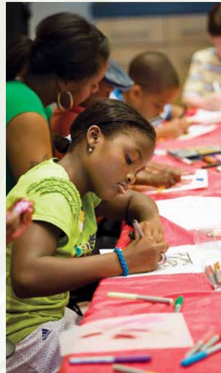
A child creates during the Bechtler Museum of Modern Art's Family Day.

Levine Center for the Arts Artist: Cliff Garten Title: Levine Lanterns Description: Stainless steel sculptures