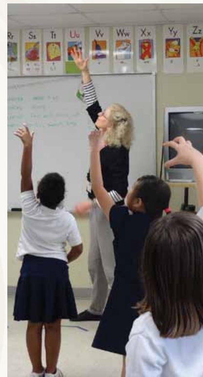
Winget Park Elementary students participate in a Mime writing residency.

In partnership with CMS’ After School Enrichment Program, ASC provided a 5-week digital media and literacy camp for rising 1st through 8th grade students with arts and cultural experiences to become effective communicators and consumers, critical thinkers, creative problem solvers, and empowered citizens. Students received instruction from CMS master-level licensed teachers.