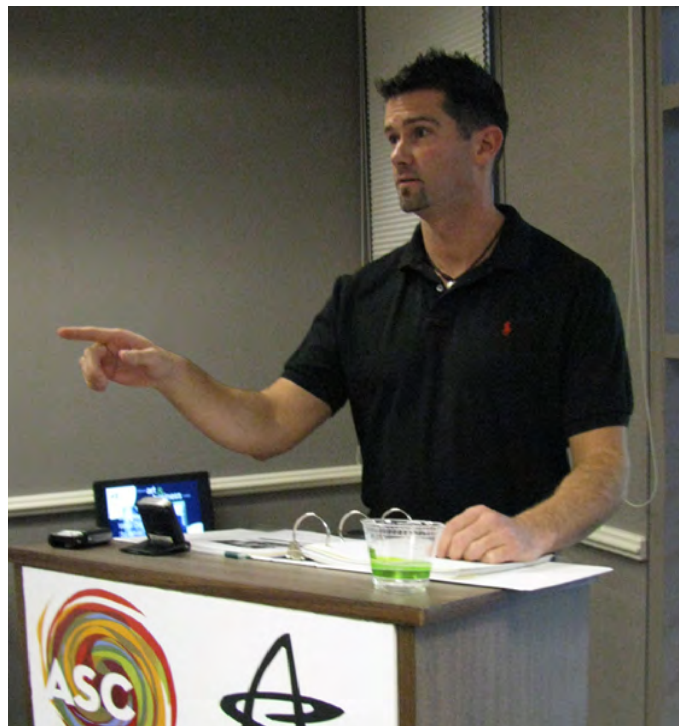
Artist as an Entrepreneur/courtesy of ASC | McColl Center for Visual Art/courtesy of McColl Center for Visual Art

In an effort to provide arts organizations the resources needed to better understand the marketplace, ASC continued its partnership with the National Arts Marketing Project (NAMP). A program of Americans for the Arts, NAMP helps arts organizations acquire and implement sophisticated marketing skills.