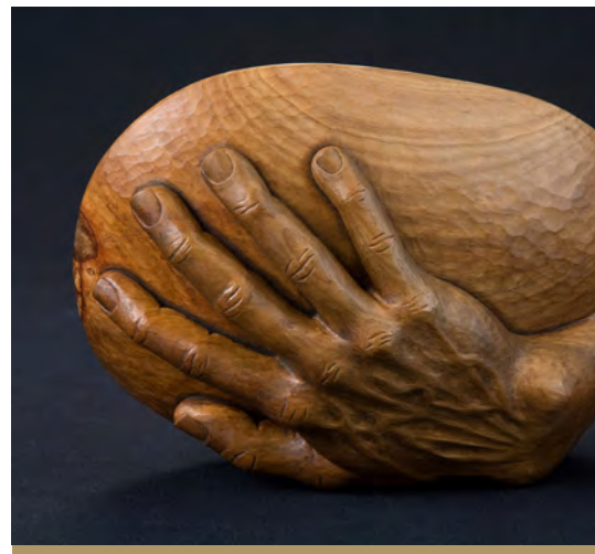
Manus Dextra/ | "who I am now," "travel light" and "her voice to be heard"